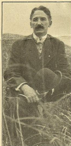
A snapshot near Hong Kong.